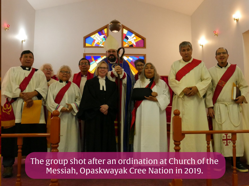
The group shot after an ordination at Church of the Messiah, Opaskwayak Cree Nation in 2019.