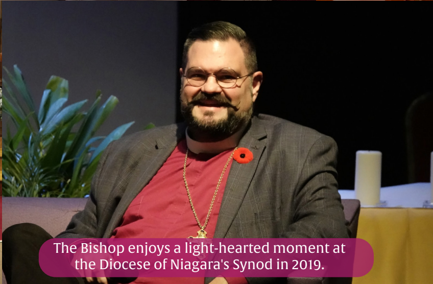
The Bishop enjoys a light-hearted moment at the Diocese of Niagara's Synod in 2019.