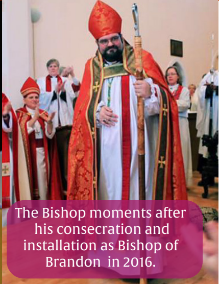
The Bishop moments after his consecration and installation as Bishop of Brandon in 2016.