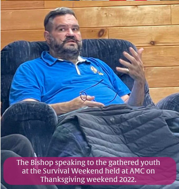
The Bishop speaking to the gathered youth at the Survival Weekend held at AMC on Thanksgiving weekend 2022.