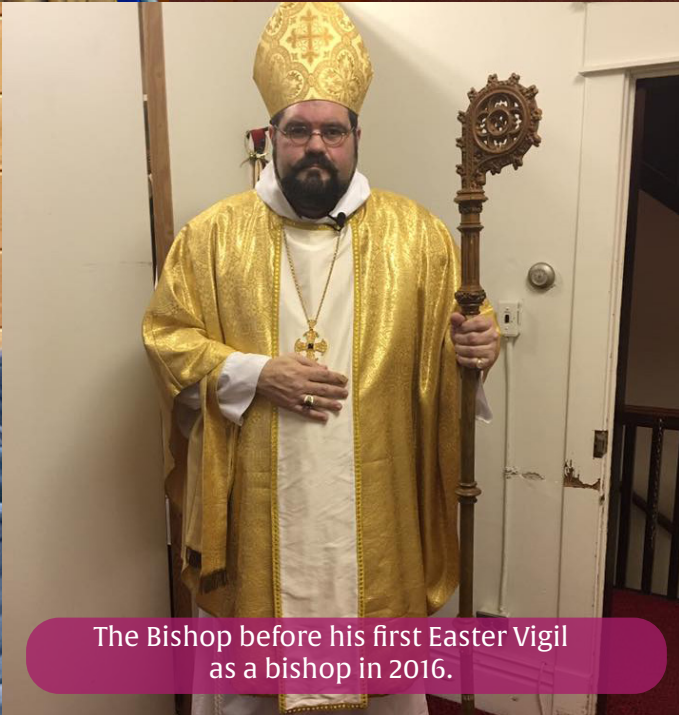
The Bishop before his first Easter Vigil as a bishop in 2016.