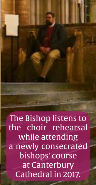
The Bishop listens to the choir rehearsal while attending a newly consecrated bishops' course at Canterbury Cathedral in 2017.