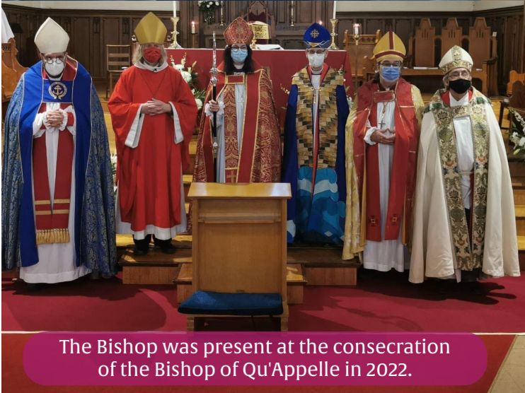
The Bishop was present at the consecration of the Bishop of Qu'Appelle in 2022.