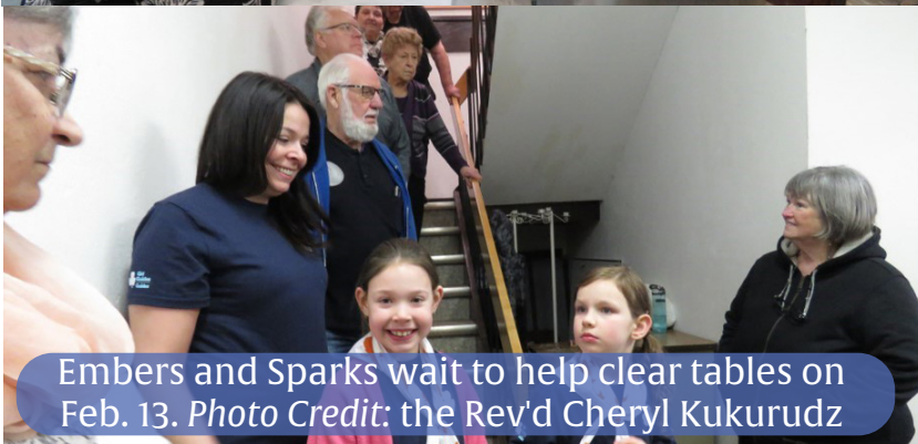
Embers and Sparks wait to help clear tables on Feb. 13.